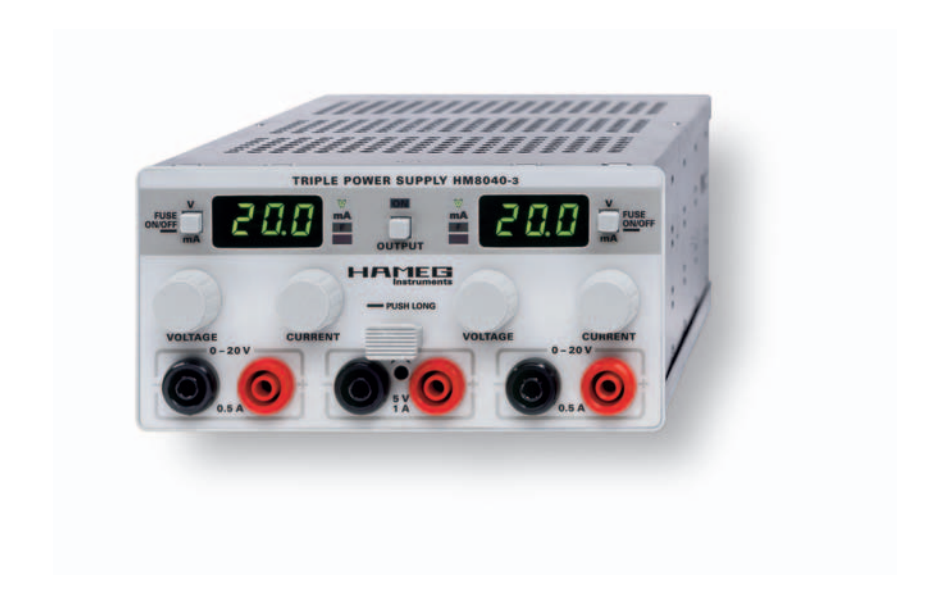
Mainframe HM8001-2 required for operation