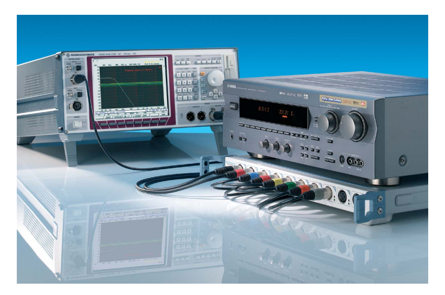
Multichannel measurements on audio/video receiver

The Audio Switcher R&S®UPZ can be operated not only via the R&S®UPL. Through its RS-232-C interface, it can also be controlled directly from other