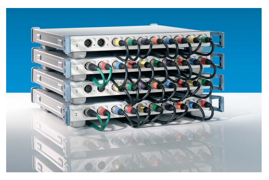
With the Audio Switcher R&S® UPZ, up to 128 input and 128 output channels can be cascaded

units or a controller. This opens up new possibilities; for instance, in broadcasting stations, where studio operations require the switching of several audio channels.