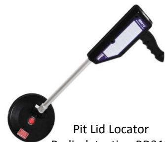
Pit Lid Locator Radiodetection RD312

Tel: 1800 680 680 Email: onestopshop@tmg.com.au Web: www.tmg.com.au