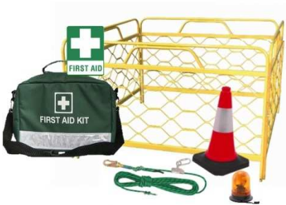
Wide Range of Tools & Safety