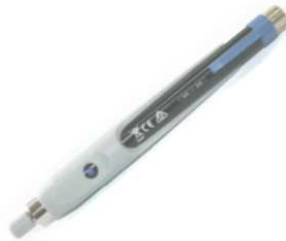
Visual Fault Locator Kingfisher KI6354