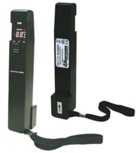
Traffic Identifier Kingfisher KI6171