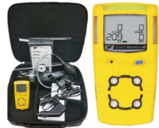
Gas Analyser Kit Honeywell Microclip XL Kit