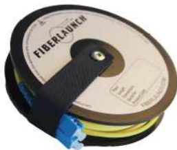
150 Meter Fibre Launch Lead