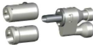
Viavi FBPT-COD-L Opti Tip Inspection Tip