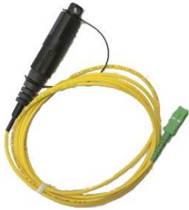
Opti Tap to SC/APC Patch Lead