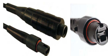
Opti Tip Connector