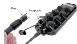
Opti Tap Connector