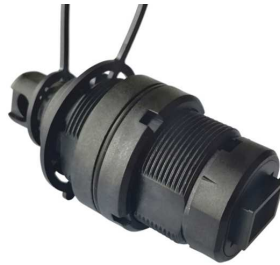
Optitap 2SC/APC Connector